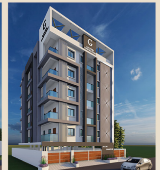
Sri Sai Sanidhi